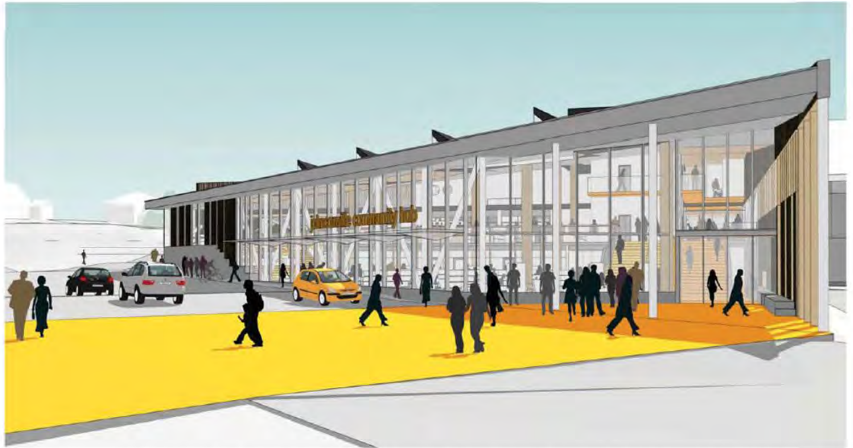
JOHNSONVILLE LIBRARY & COMMUNITY HUB

a t h f i e l d a r c h i t e c t s l i m i t e d