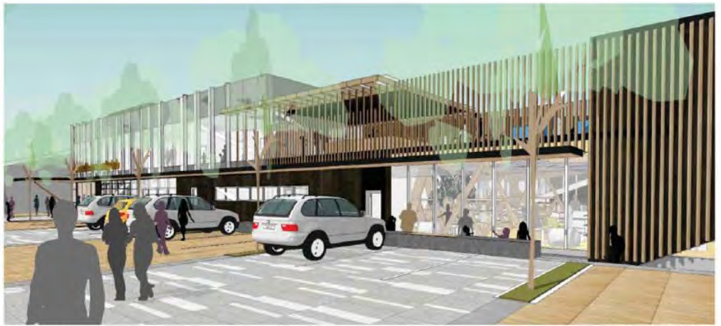
View of Western Elevation